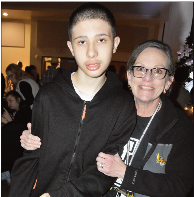
This special ed teacher gives a quick hug to one of her favorite people at the Dayton ISD Special Education Winter Dance last Thursday.

Like a good neighbor, State Farm is there.