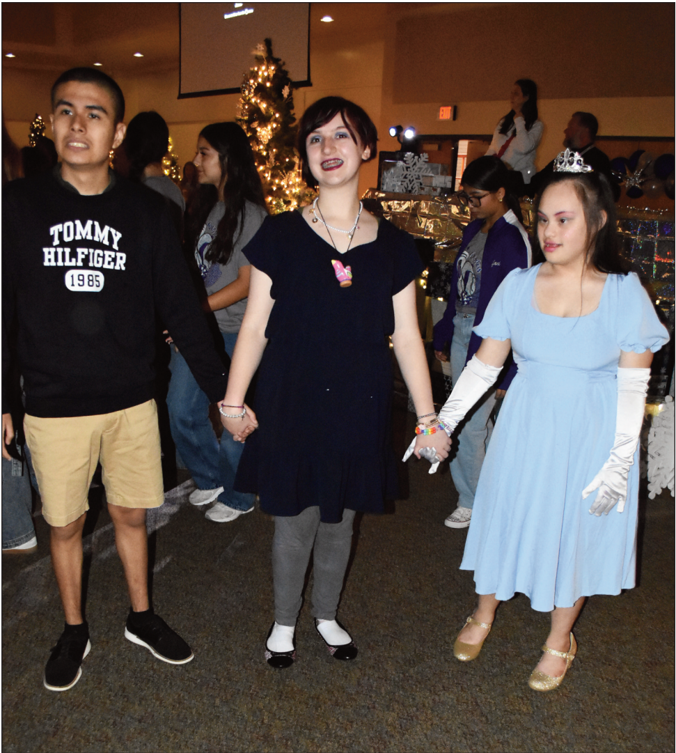
The beautiful princess with the sparkly shoes at right was joined for a quick photo with two of her friends at the Dayton ISD Special Education Winter Dance last Thursday.

This program is supported by a grant from the Texas Veterans Commission Fund for Veterans' Assistance. The Fund for Veterans' Assistance provides grants to organizations serving veterans and their families. For more information, visit tvf.texas.gov.