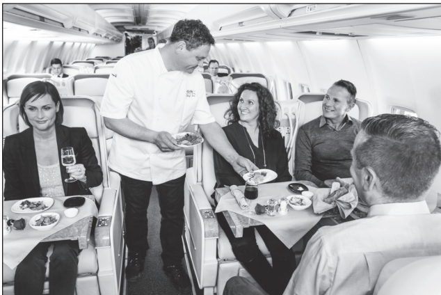
Fifty Business Class seats for June 2025 Commemorative flight

Will there be other excursions, you ask? You bet your bottom dollar! They're planning more themed luxury flights, including an around-the-world voyage in 2027 to celebrate the 100th anniversary of the founding of Pan Am. Glitz, baby! ElyAirLines.substack.com