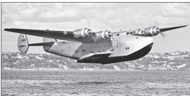
Pam Am's Boeing 314 Clipper, 1930s