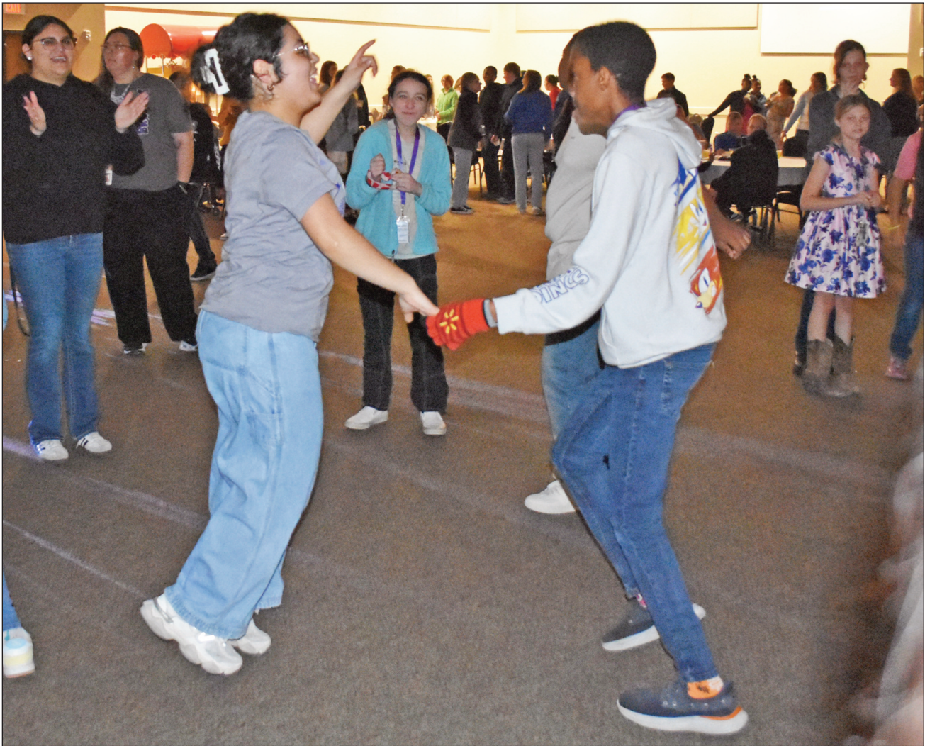
Both ladies and gentlemen were having a lively, fun-filled day at the Dayton ISD Special Education Winter Dance last Thursday.