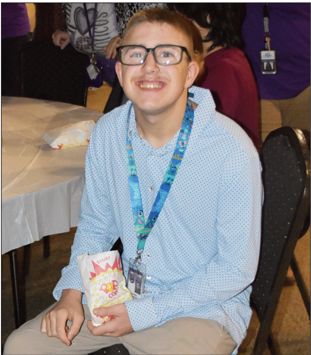
It's likely that the students attending the Dayton ISD Special Education Winter Dance last Thursday wish every school day was this much fun.