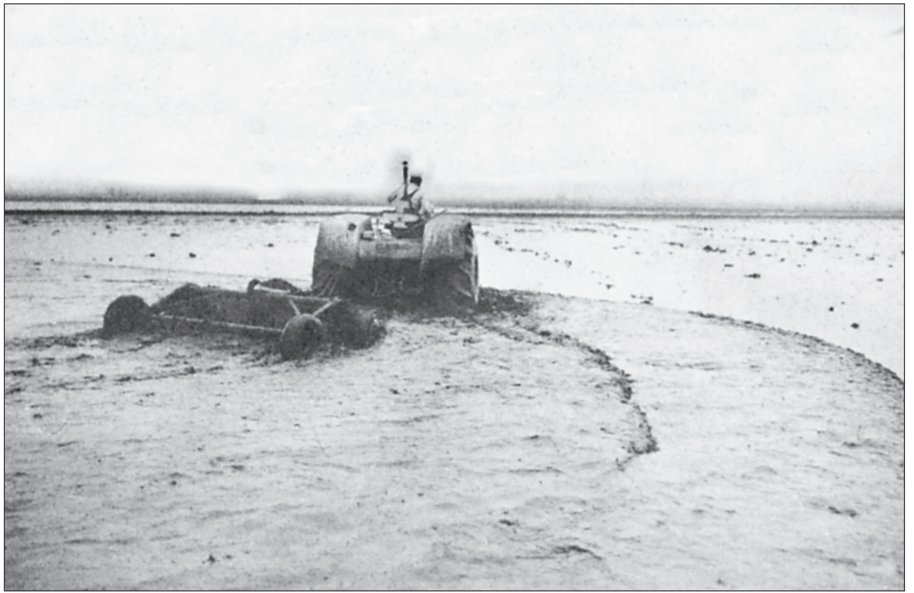
Water land leveling on the Seaberg farms in Liberty County. Much more of this practice will be done this year.