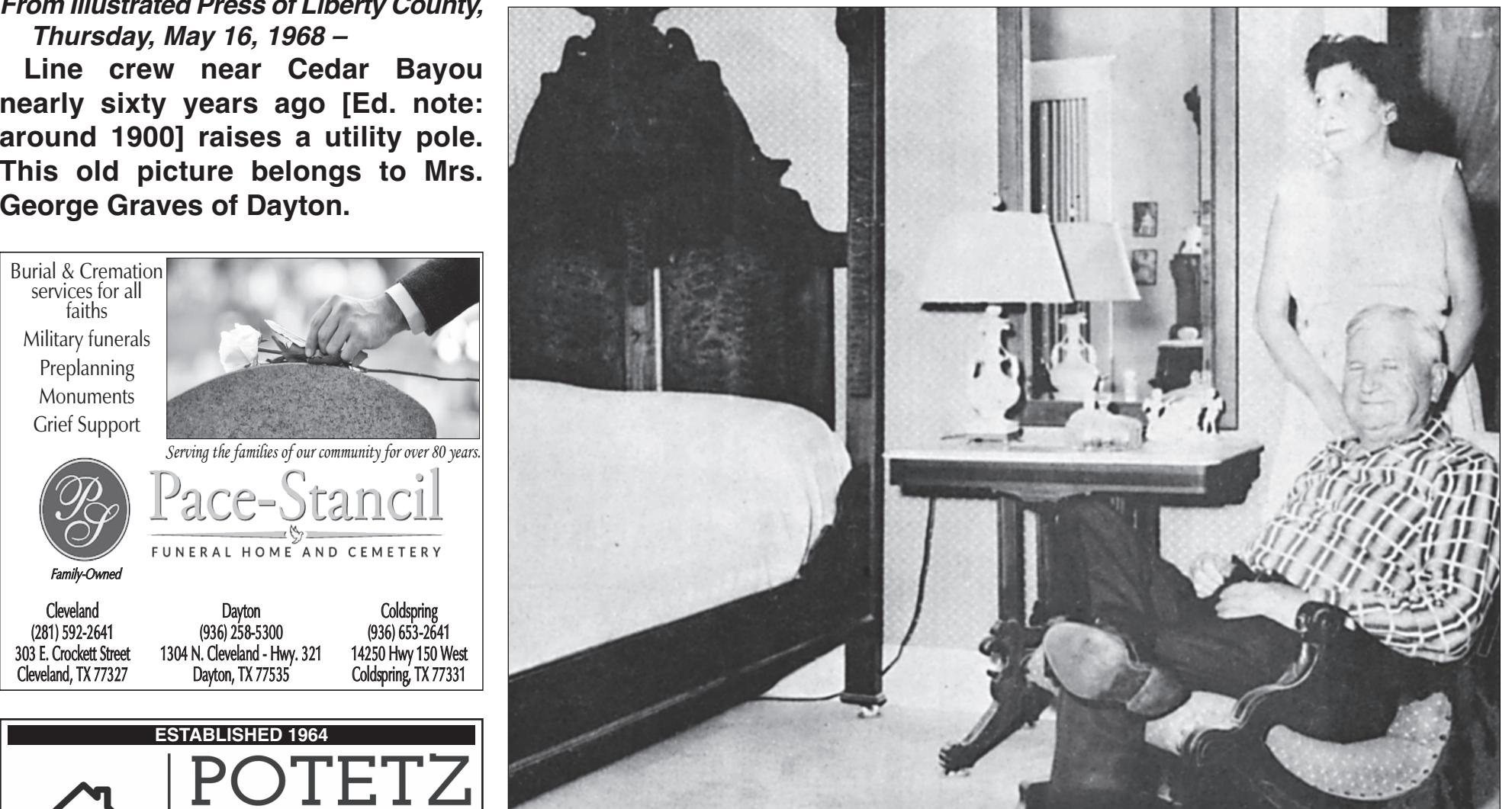
From Illustrated Press of Liberty County, Thursday, May 16, 1968 –