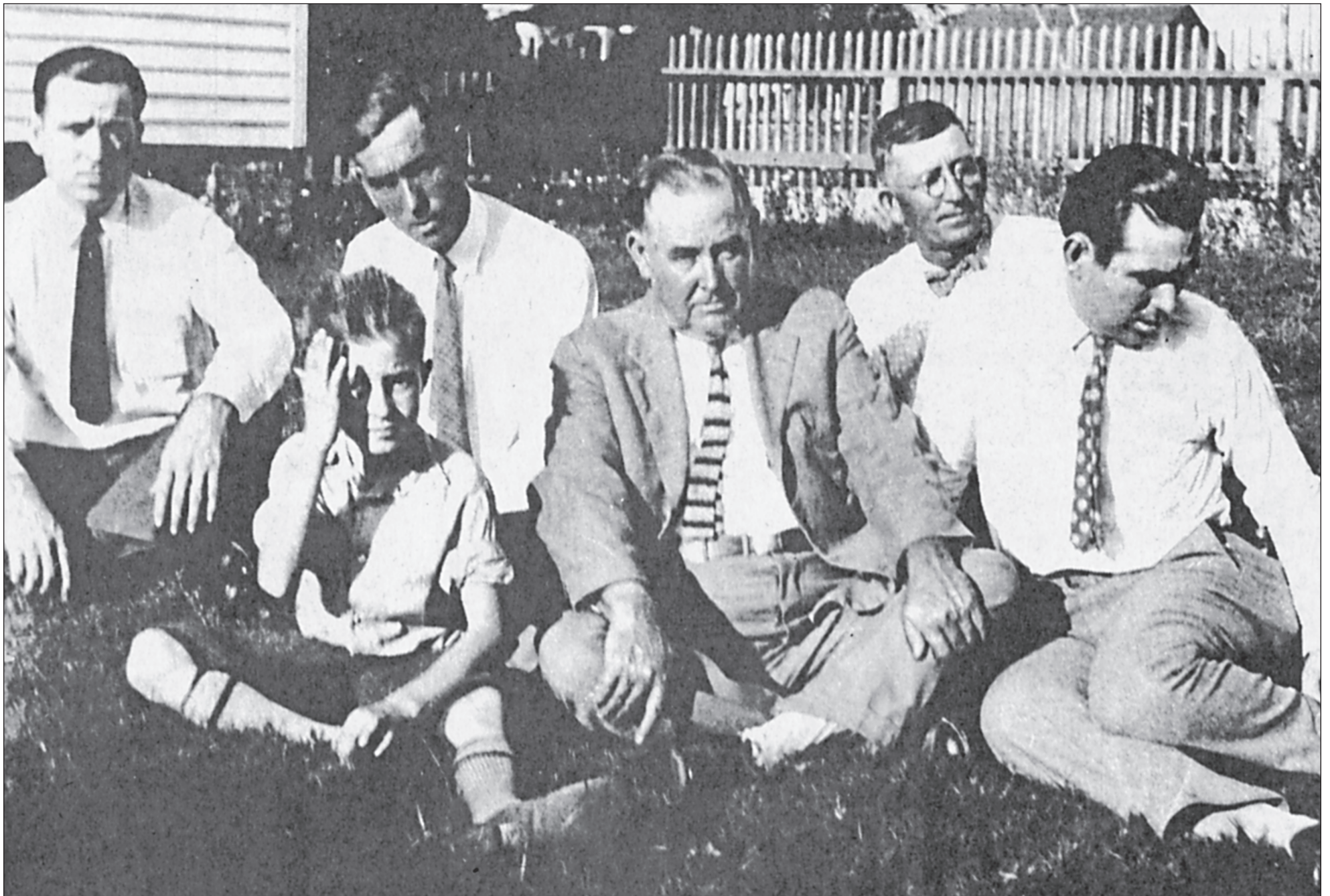
From Illustrated Press of Liberty County, Thursday, May 16, 1963 – THE CLAN McGINTY