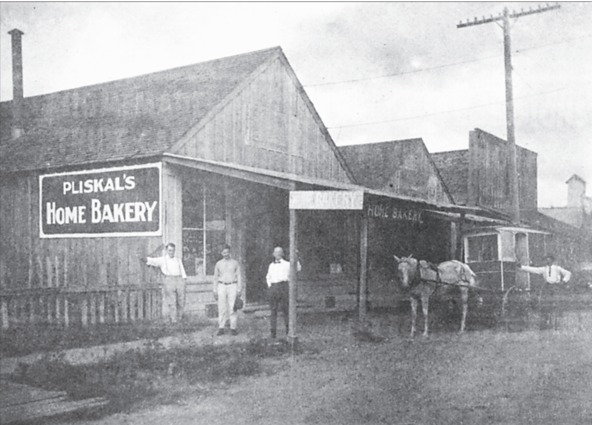
From Illustrated Press of Liberty County, Thursday, December 16, 1965 – Part of Liberty business section as it ap- peared about the time of World War I.